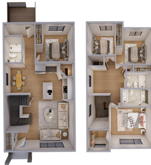
869 SQ.FT. MAIN FLOOR

Date Listed March 7th, 2025 Days on Market 35 Zoning Zone 91